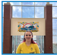
Emily Wart Foundation for Youth